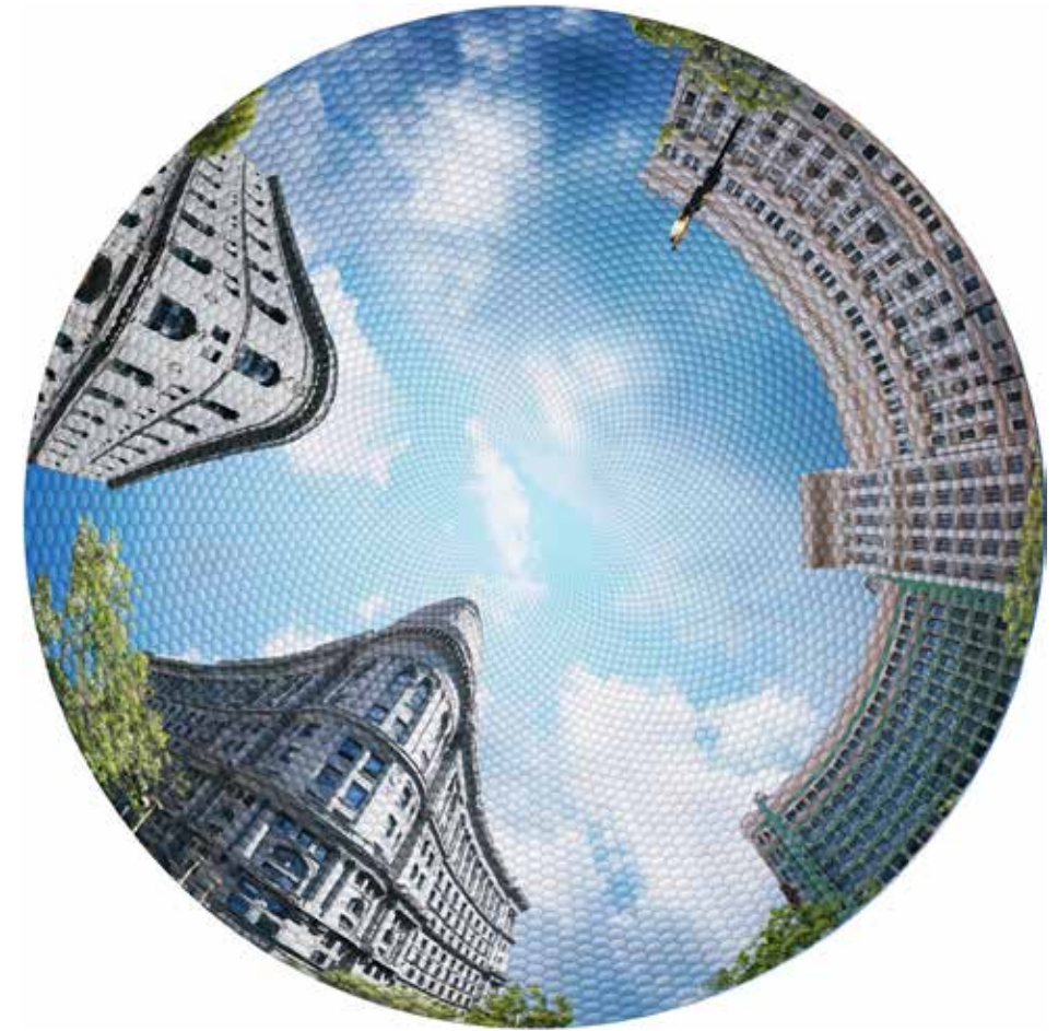
Stephen Galloway, Galloway Elysium artwork rendering represents the image looking up from the station to the surrounding neighborhood.