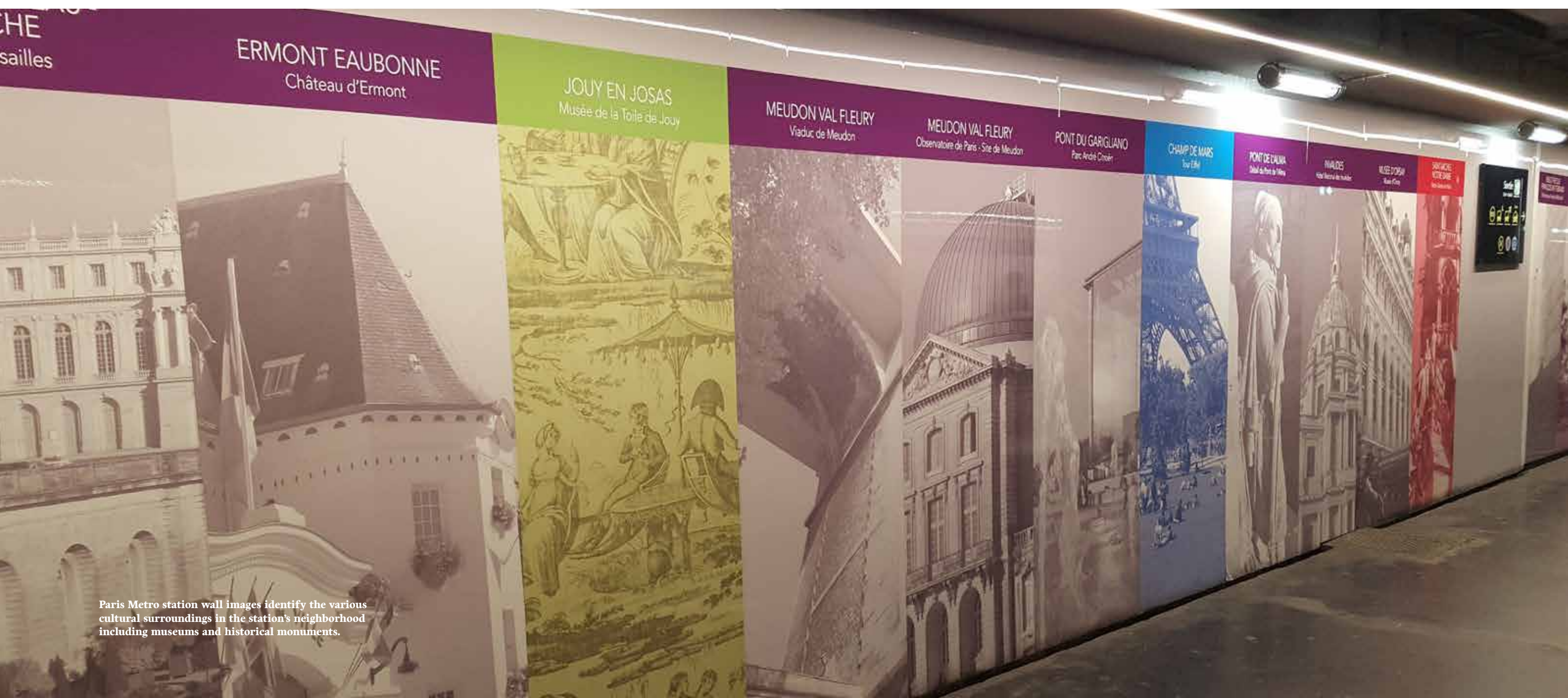
Paris Metro station wall images identify the various cultural surroundings in the station's neighborhood including museums and historical monuments.

Recommendations are presented within two timeframes for implementation: Short term – one to three years, and Mid-Long term – four to ten years.