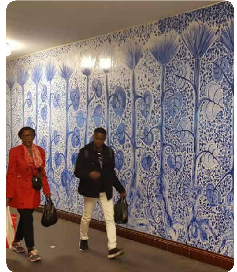
Barthélémy Togo's Célébrations Château Rouge Metro station is an example of a site-integrated artwork.