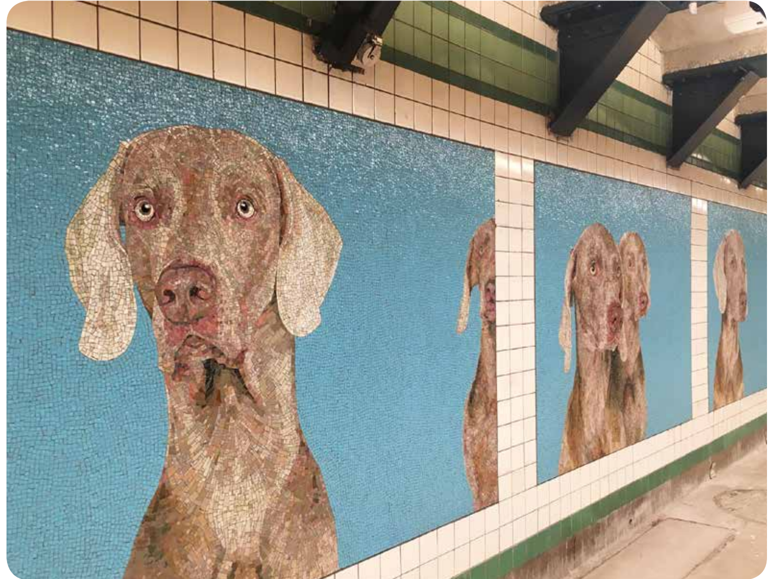
Artist William Wegman's Stationary Figures are part of New York's subway retrofit artwork program which integrates mosaic tile artwork into existing stations.

IT IS ESSENTIAL THAT, AS THE SYSTEM IS BUILT, A unified approach to creative placemaking , placekeeping and cultural equity are integral to its design strategy. Placemaking engages arts and cultural expression to activate, define and reinforce the identity of communities, as they develop and expand. Placekeeping listens to the voice of existing communities, acknowledging and honoring history and culture, helping to preserve the character of places, respecting traditions and building upon them. This plan establishes an arts and cultural framework to accomplish both placemaking and placekeeping goals while promoting cultural equity. This approach is consistent with BART's Transit Oriented Development Policy which included strategies to use BART's position as a property owner to increase walkability by offering "community amenities and services that are complementary with local visions and needs."