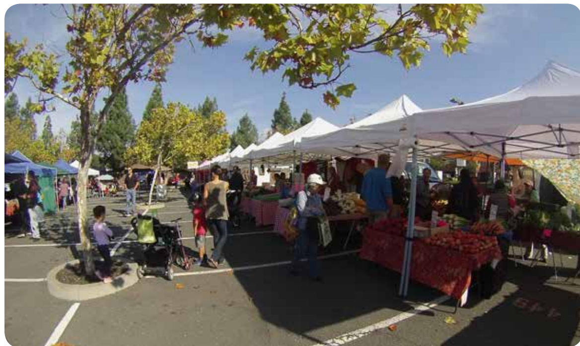
The Castro Valley Farmers Market is one example of a community-initiated activity that happens outside of the BART station and on the parking lot.

Reinforce cultural identity and traditions by offering Bay Area communities the opportunity to generate visual, literary and performing art projects and programs on BART property outside stations.