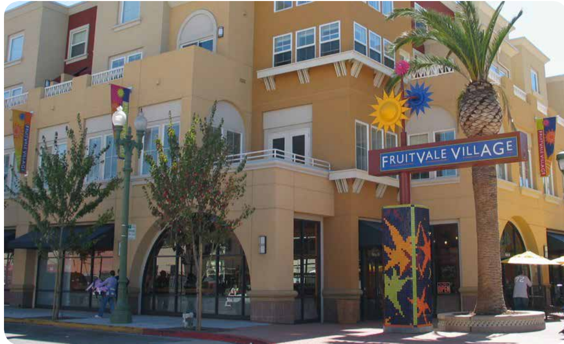
Fruitvale Village represent transit-oriented development that connects with the neighborhood through culture, housing, retail and community resources. Square Peg Design.

BART is committed in this masterplan to be a good community partner by promoting cultural equity in its guidelines for TODs on its property.