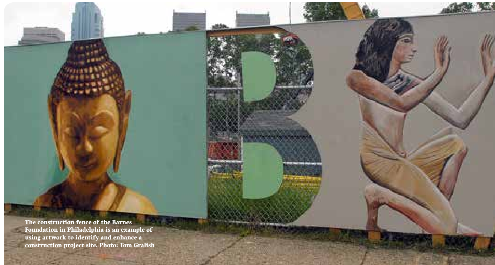
The construction fence of the Barnes Foundation in Philadelphia is an example of using artwork to identify and enhance a construction project site.