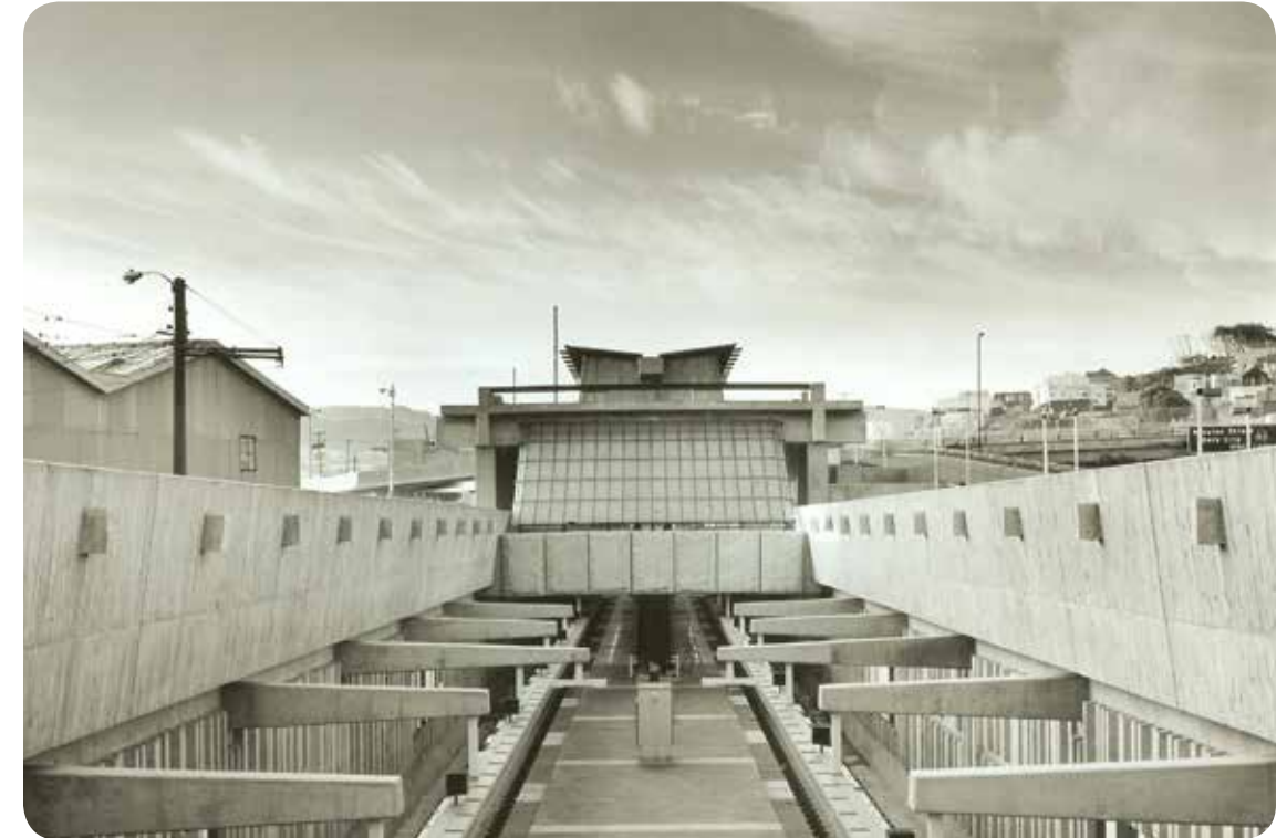
Balboa Station

CREATING A UNIFIED ARTS STRATEGY FOR BART IS not simply about making stations and station areas more attractive and pleasant, it is also a means of showcasing the rich arts and cultural life of the region and reflecting the diversity of individual communities. The BART system can reflect and celebrate local talent as a means of reinforcing the visual and cultural identity, history and traditions of different communities and sharing these with visitors. It can focus its efforts on both placemaking and placekeeping. Placemaking refers to using artistic and cultural forms of all kinds, ranging from visual and literary arts and performances to culinary arts, to help create interesting new places. Placekeeping is a deliberate process of both preserving the character of an existing place, its cultural history and traditions as defined by its community and building upon them. The following strategies will help accomplish these goals. They will help make all riders feel welcome and will support cultural equity throughout the region.