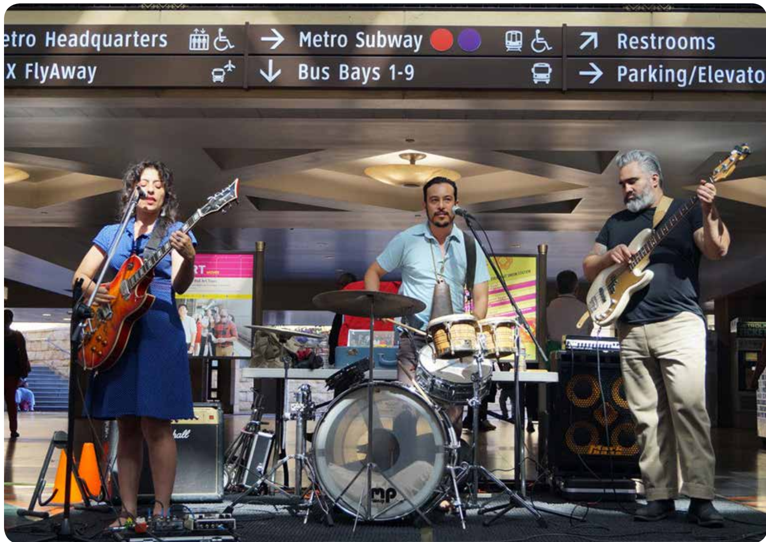
Los Angeles' Union Station is both a transportation hub and a cultural connection to monthly curated public events on the arts and culture of the city.