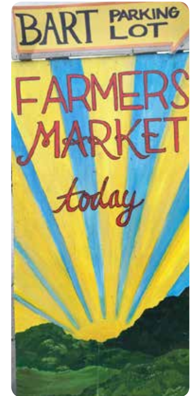
Investing in an infrastructure that supports community events such as farmers markets can encourage positive engagement with the station.