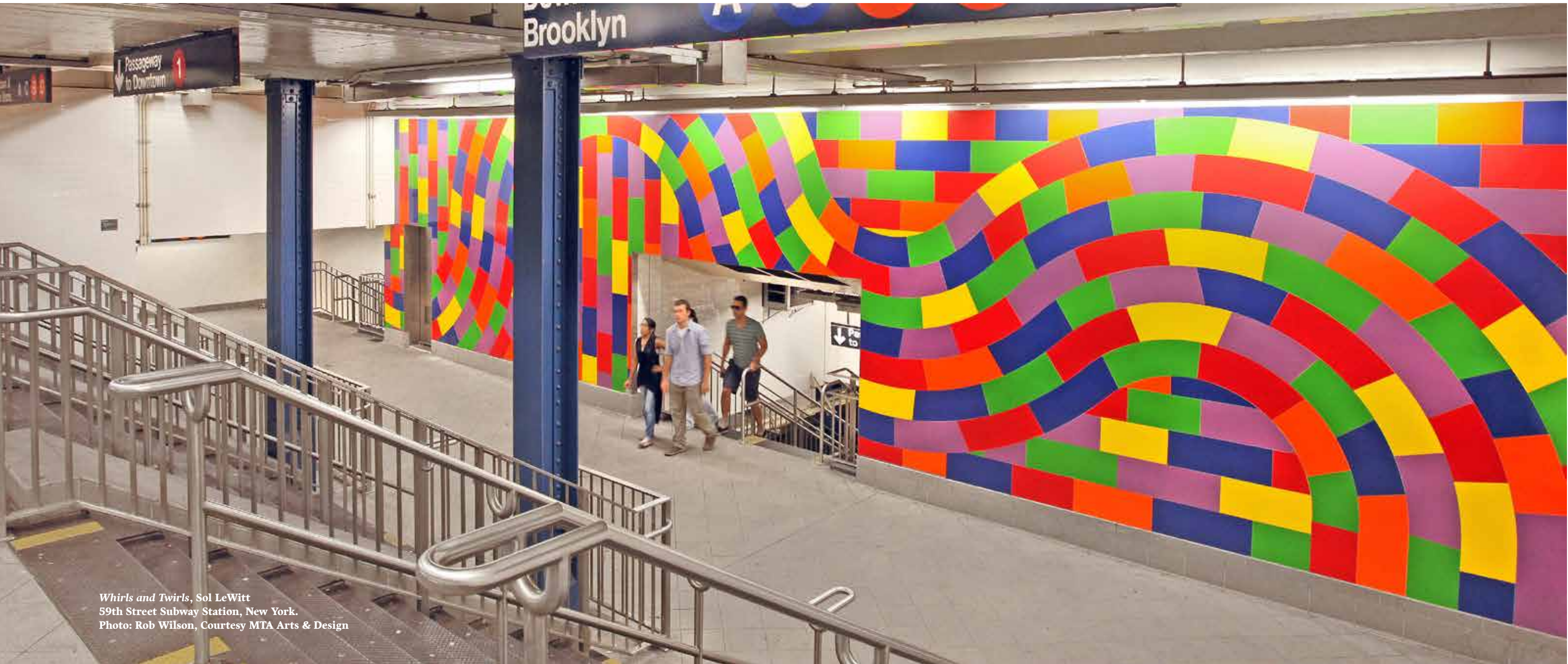
Whirls and Twirls , Sol LeWitt 59th Street Subway Station, New York.

Integrating high standards of art into the system and emphasizing BART's role as a cultural corridor will be an important part of this narrative. The BART arts master plan establishes a framework for achieving these goals.