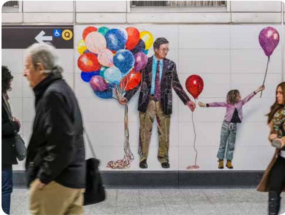
Perfect Strangers, Vik Muniz, 2nd Ave Subway Station, New York.