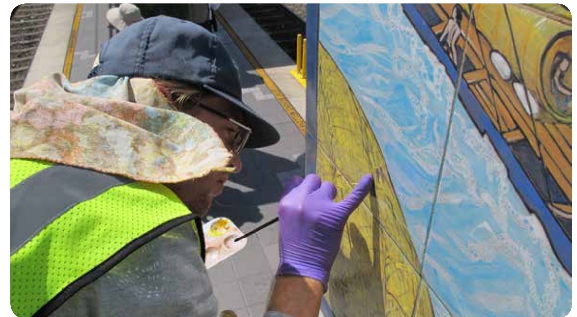
Conservation and routine maintenance are important for the longevity of the public artwork and is an example to the public that the artwork is appreciated.