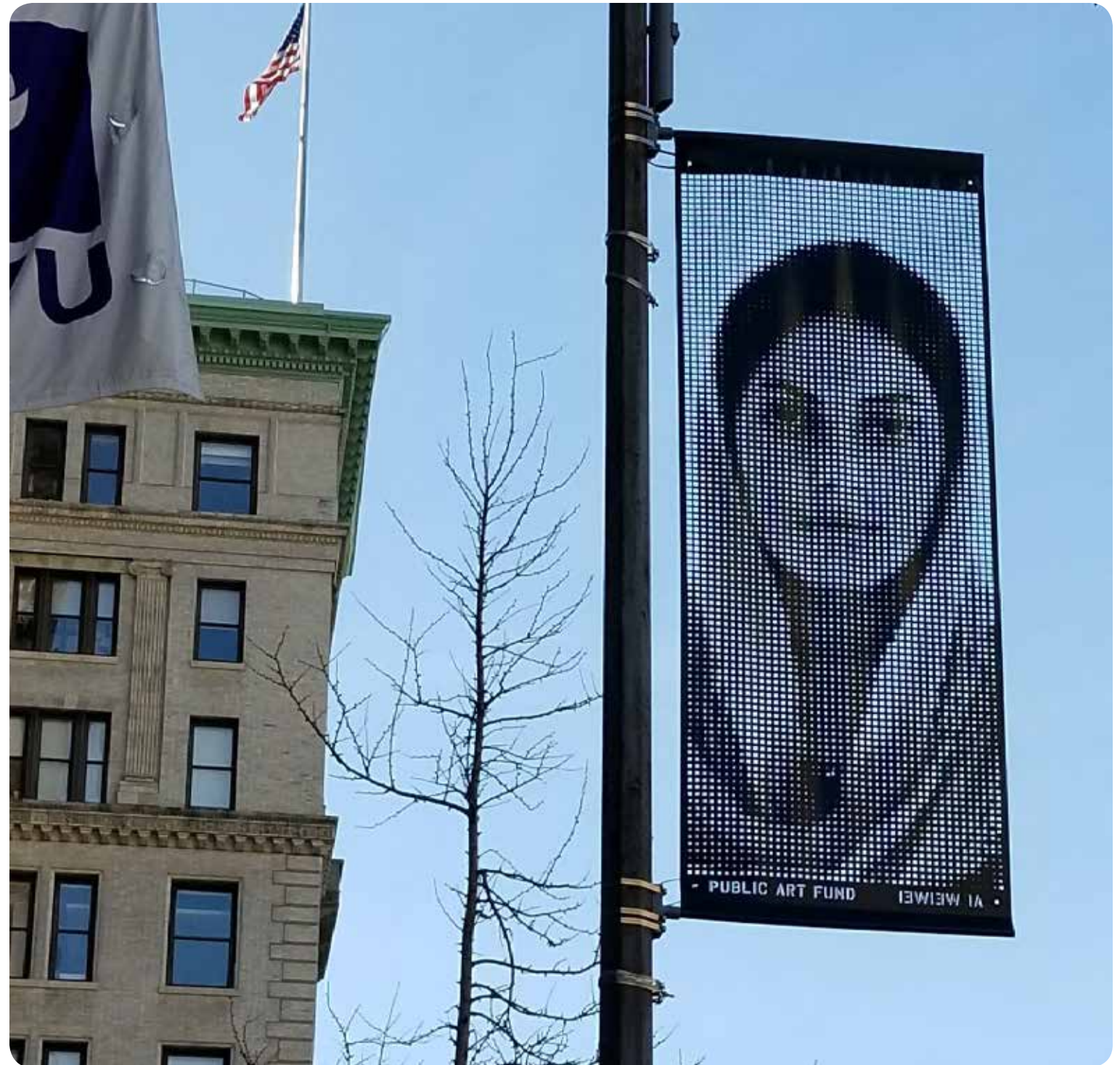
Good Fences Make Good Neighbors by artist Ai Wei Wei, commissioned artwork by the Public Art Fund in collaboration with the Department of Transportation, reflects New York's diversity.