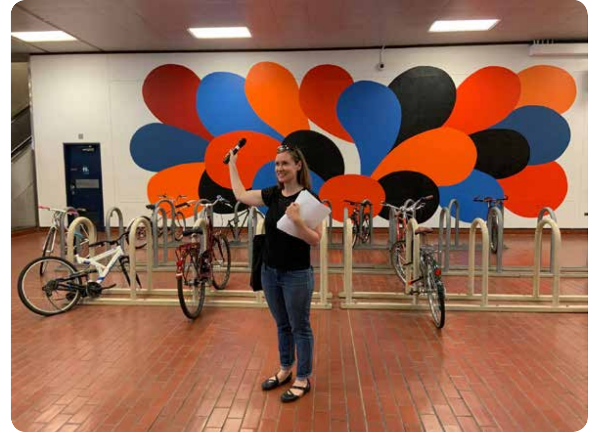
The Northern California Chapter of Docomomo is one of many organizations that can partner with BART to create collaborative public art tours.

Create a database of artworks at BART stations that includes information about the artists' backgrounds and a description of their art, which can be showcased on the pages of the BARTable and BART Arts Program website.