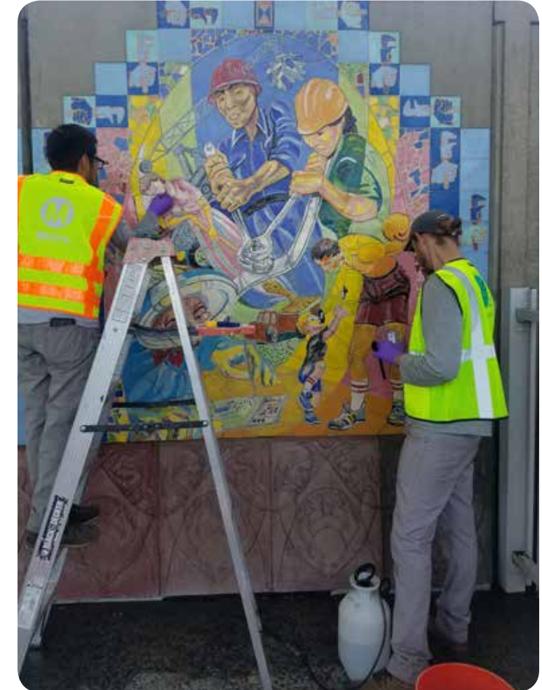
LA Metro and the RLA Conservation staff working together to repair artworks at the Slauson Station.