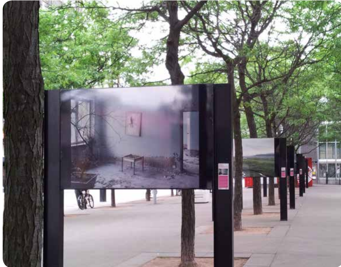
The City of Montreal developed a flexible framework for a changing gallery near station entrances.

BART can take immediate actions to signal its intention to connect riders to culture throughout the Bay Area by sponsoring changing artworks and performances.