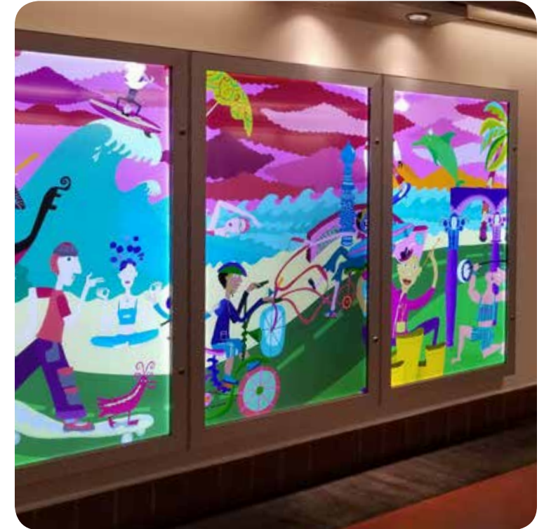
Lightbox artwork in the LA Union Station are part of the ongoing changing exhibit space that engages with the transit riders.