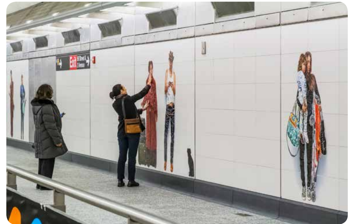
Vik Muniz mosaic artwork creates a connection between the riders and the subjects of the artwork. 2nd Ave Subway Station, New York.

Promotion of these destinations also provides opportunities for developing partnerships with the arts and culture providers, as well as potential funders from the business sector.