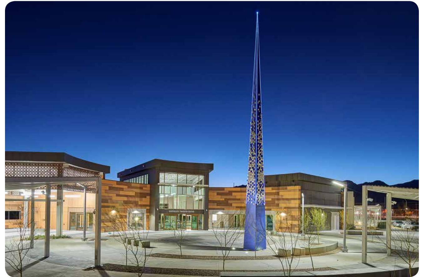
El Paso's Northgate Transit Center is an example of a mixed-use development and a public-private partnership with residential, retail and commercial offices.

Developers throughout the Bay Area already engage artists and arts spaces in new developments and neighborhood revitalization projects. It is key that TODs build on this momentum by encouraging authentic neighborhood participation in helping to establish the cultural relevance of art in TOD projects.