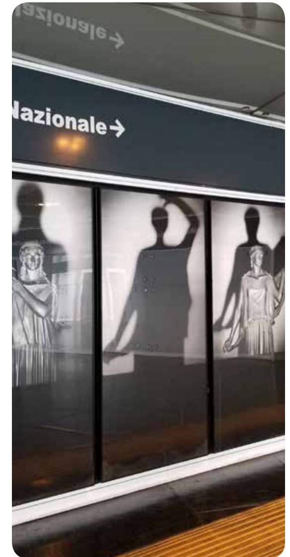
Dancers from the Villa dei Papiri by artist Mimmo Jodice are photographs of artifacts from the National Archeological Museum at Naples Museum Station.