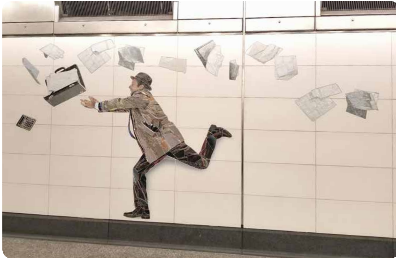
Perfect Strangers, detail, by artist Vik Muniz is a series of mosaic murals on the Second Avenue subway that depict the everyday traveler on the subway.

This plan envisions BART as the Bay Area's cultural corridor, celebrating the arts to promote exploration and attract new riders.