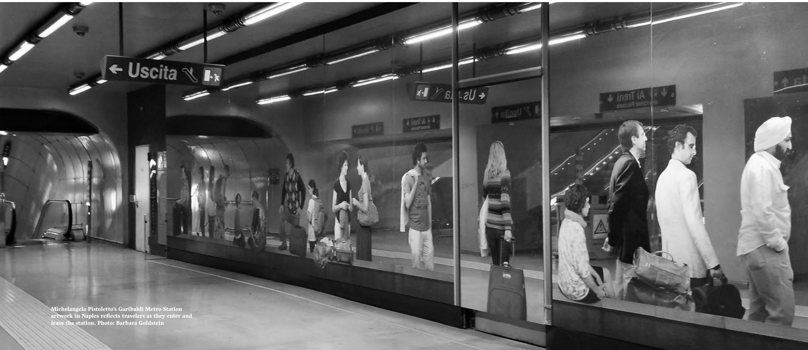
Michelangelo Pistoletto's Garibaldi Metro Station artwork in Naples reflects travelers as they enter and leave the station.

The San Francisco Bay Area Rapid Transit District (BART) seeks to implement an Arts Program that will enrich rider experience, strengthen station identity, connect to communities, and support a distinctive sense of place at stations and beyond. BART's Arts Program will build on best practices, lead the field in community participation strategies, engage with arts and cultural organizations and artists, and make riding BART more delightful, vibrant and welcoming.