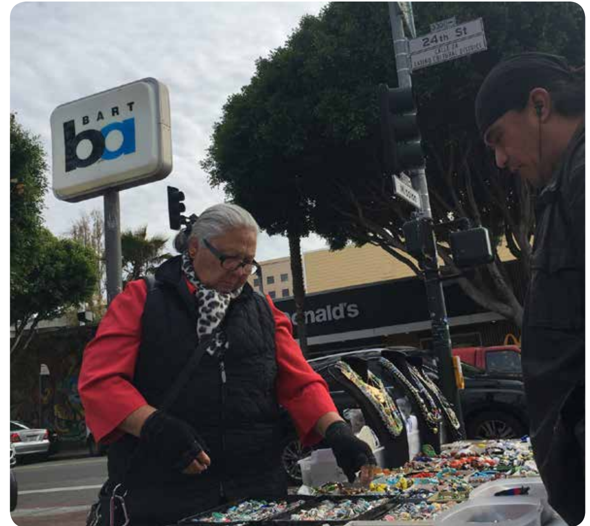
Art and craft vendors have found BART station entrances as a reliable location to sell their artwork.

The following recommendations outline how to initiate and manage the Community Arts Program.