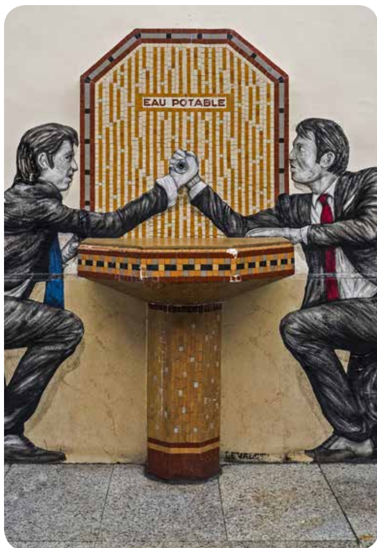
Conflit d'intérêt by artist Levalet is an example of temporary artwork by the collaboration between the Parisian public art group, Quai 36, the SNCF Gares and Connexions in Paris.