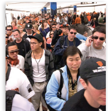
2010 – BART carries a record high 522,200 riders celebrating the San Francisco Giants World Series victory.