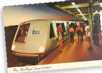
BART postcard, circa early 1970s.