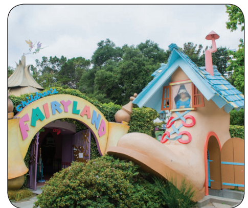
Clockwise from top: Aquarius Records in San Francisco (24th St. Mission Station); Mac and cheese from Homeroom in Oakland (MacArthur Station); Children's Fairyland in Oakland (19th St./Oakland Station); and a latte from Tartine in SF (16th St. Mission Station).

Lake Merritt boasts a 3-mile scenic waterfront walk in the heart of Oakland. Gondola ride, jogging path or wildlife exploration, Lake Merritt provides some nature and peace of mind amidst the urban landscape. Take the kids to Children's Fairyland, right on its shore, for a family-friendly day trip.