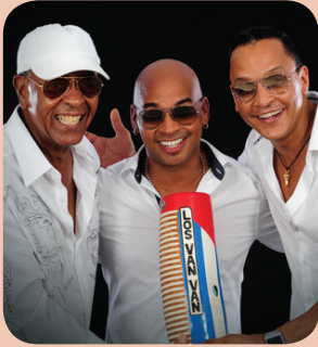
Cuban all-stars Los Van Van performs Aug. 14 at Davies Symphony Hall as part of the SFJAZZ Summer series.