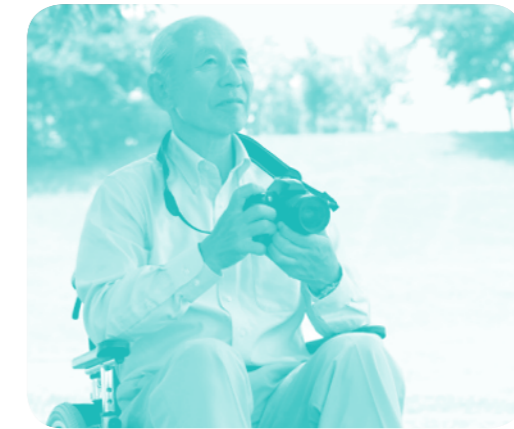
All BART cars have space to accommodate wheelchair users.