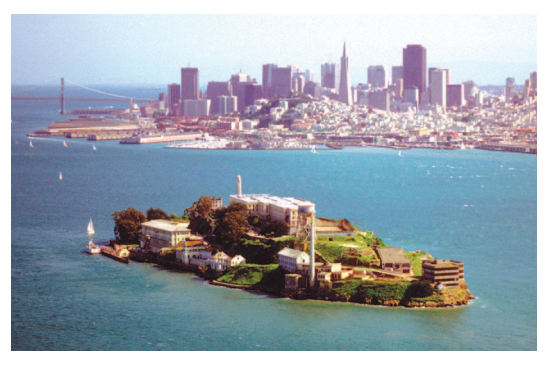
Explore Fisherman's Wharf and take a ferry for a tour of Alcatraz Island