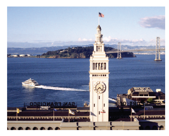
The San Francisco Ferry Building