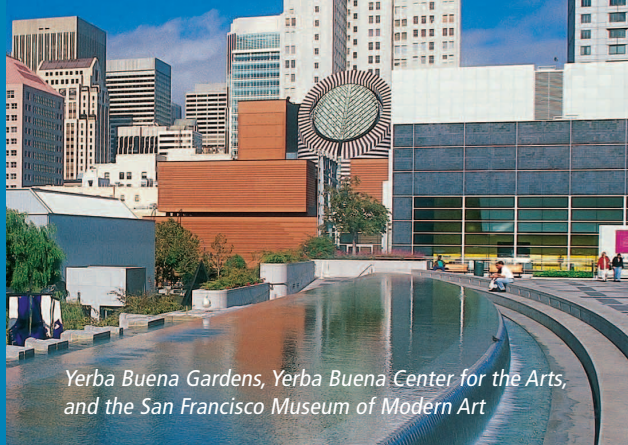
Yerba Buena Gardens, Yerba Buena Center for the Arts, and the San Francisco Museum of Modern Art

Stunning views, historic landmarks, culturally diverse cuisine and shopping—all spread throughout an eclectic mix of neighborhoods—make San Francisco a world-class destination. There truly is something for everyone in this one-of-a-kind city.