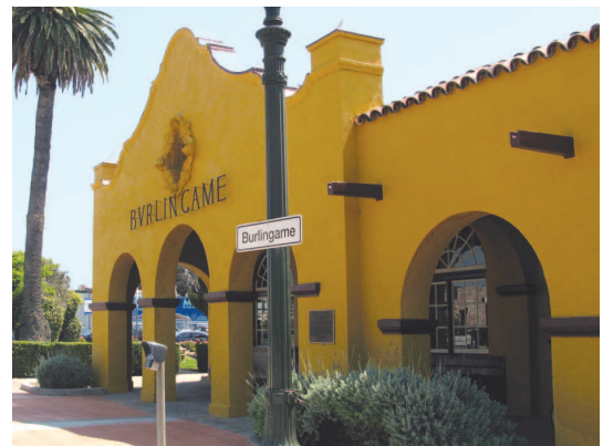
Burlingame Railroad Station, built in 1894, is listed on the National Register of Historic Places

MILLBRAE BART: Caltrain to Santa Clara Station, transfer to VTA's Airport Flyer, Route 10