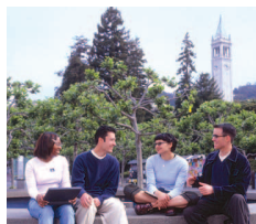
University of California at Berkeley campus