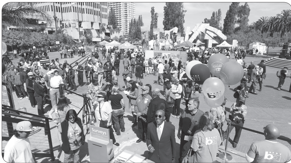
The fifth annual BART Blue Sky Festival is Wednesday, April 22, from 11am to 1:30pm at Justin Herman Plaza in San Francisco. This Earth Day celebration includes games, eco exhibits, giveaways and more!

April 22 marks the 45th anniversary of Earth Day, and it also happens to be the date of BART's fifth annual Blue Sky Festival.