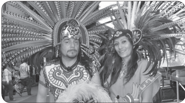
Aztec dancers at a previous Cesar Chavez Day celebration.

Commemorate and celebrate the life and work of labor and civil rights leader Cesar Chavez on April 18 at San Francisco's Cesar Chavez Holiday Parade and Festival.