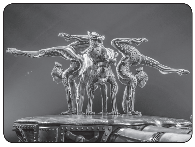
Cirque du Soleil's "Kurios" wraps up its stay at AT&T Park this month. See it before it leaves Jan. 18.