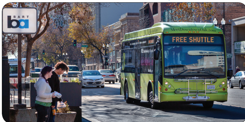
Oakland's Free Broadway Shuttle has extended its hours.