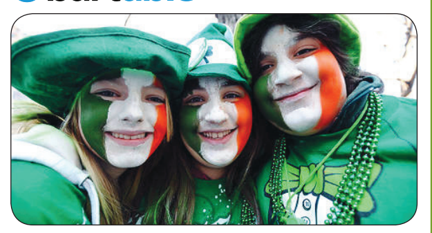
Celebrate the luck of the Irish at the St. Patrick's Day Parade March 14 in San Francisco.