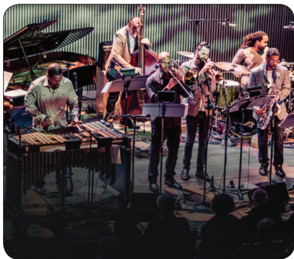
SFJAZZ's resident all-star ensemble presents sparkling new arrangements of music by the King of Pop, Michael Jackson, and freshly minted compositions by the band. Thursday, Oct. 22, at SFJAZZ Center.