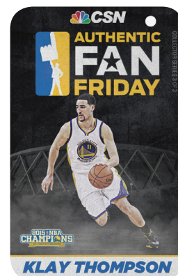
Limited edition BART-Warriors tickets (above) will be in ticket vending machines this fall.

Don't miss a single jump shot, three-pointer or dunk this NBA season. Ride BART to the Oracle Arena to see the defending NBA champs, the Golden State Warriors.