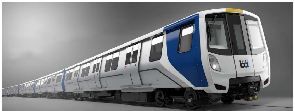
Figure 1. Computer Design Rendering – New BART Rail Car – Bombardier

This Invitation for Proposals will not lead to award of a contract. This process will identify and rank Proposals in a subsequent phase. Following BART's evaluation, BART may enter into BART Commercial License Agreements (BCLAs) that are subject to, among other things, design review, permitting, insurance and the California Environmental Quality Act (CEQA) requirements.