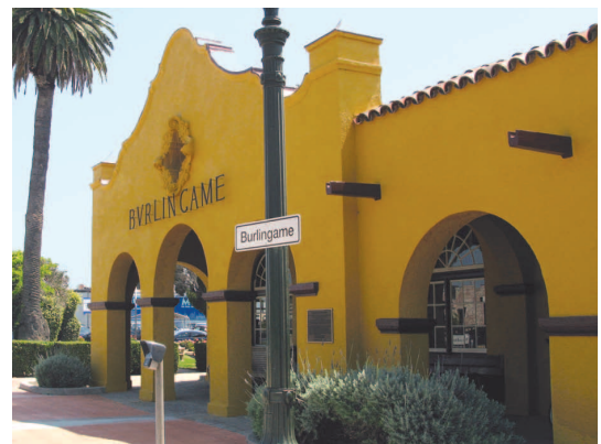
Burlingame Railroad Station, built in 1894, is listed on the National Register of Historic Places

MILLBRAE BART: Caltrain to Santa Clara Station, transfer to VTA's Airport Flyer, Route 10