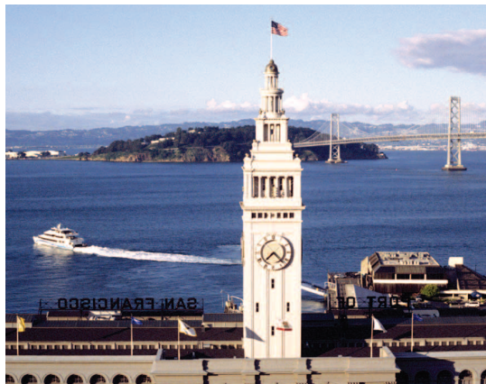
The San Francisco Ferry Building