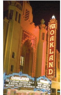
Oakland's Fox Theater

NORTH BERKELEY BART: Free shuttle during track season