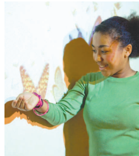
A hands-on exhibit at The Tech Museum in San Jose

MILLBRAE BART: Caltrain to Redwood City Station, walk 2 blocks Saturdays, April-November 8:00 am to 12:00 pm