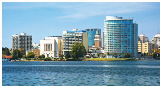
Lake Merritt and the Oakland skyline