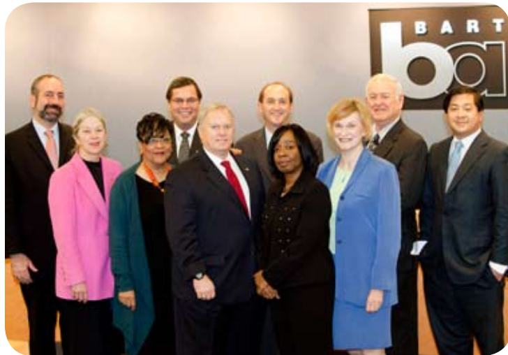
2010 BART Board of Directors (Left to Right):