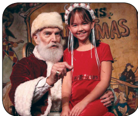
Father Christmas at the Great Dickens Fair. Open weekends Nov. 22 to Dec. 21.

sfjazz.org Banjo maestro Bela Fleck has taken his instrument where it's never gone before, turning the four-string axe into a magic carpet capable of reaching just about any destination. For this duo, Fleck teams up with fellow explorer Abigail Washburn, who also happens to be his wife.