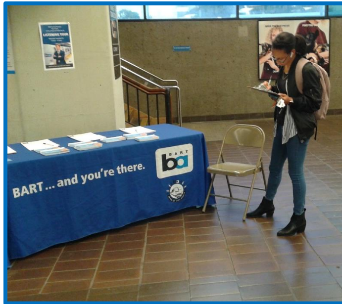
Hayward Station Outreach: October 24, 2019