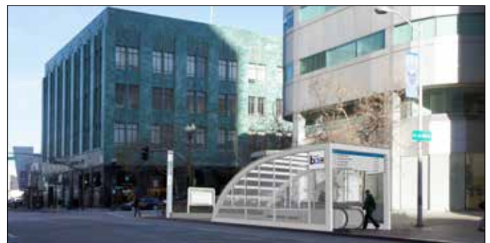
A new canopy over Oakland 19th St. Station opened in early 2015 with real time arrival information for approaching riders.

As BART ridership continues to surge, increasing capacity and fleet replacement must remain top priorities. But just as critical – over the longer term for the Bay Area – is re-investing in the system’s state-of-good-repair and remaking and modernizing the entire BART system for the future. Along with the benefits that public transit naturally brings to a region, it only makes sense that a better BART will, in turn, help ensure a better Bay Area. Riders may notice a more accelerated effort to improve BART’s decades-old stations, as BART works to implement long range visionary efforts that will improve its infrastructure.