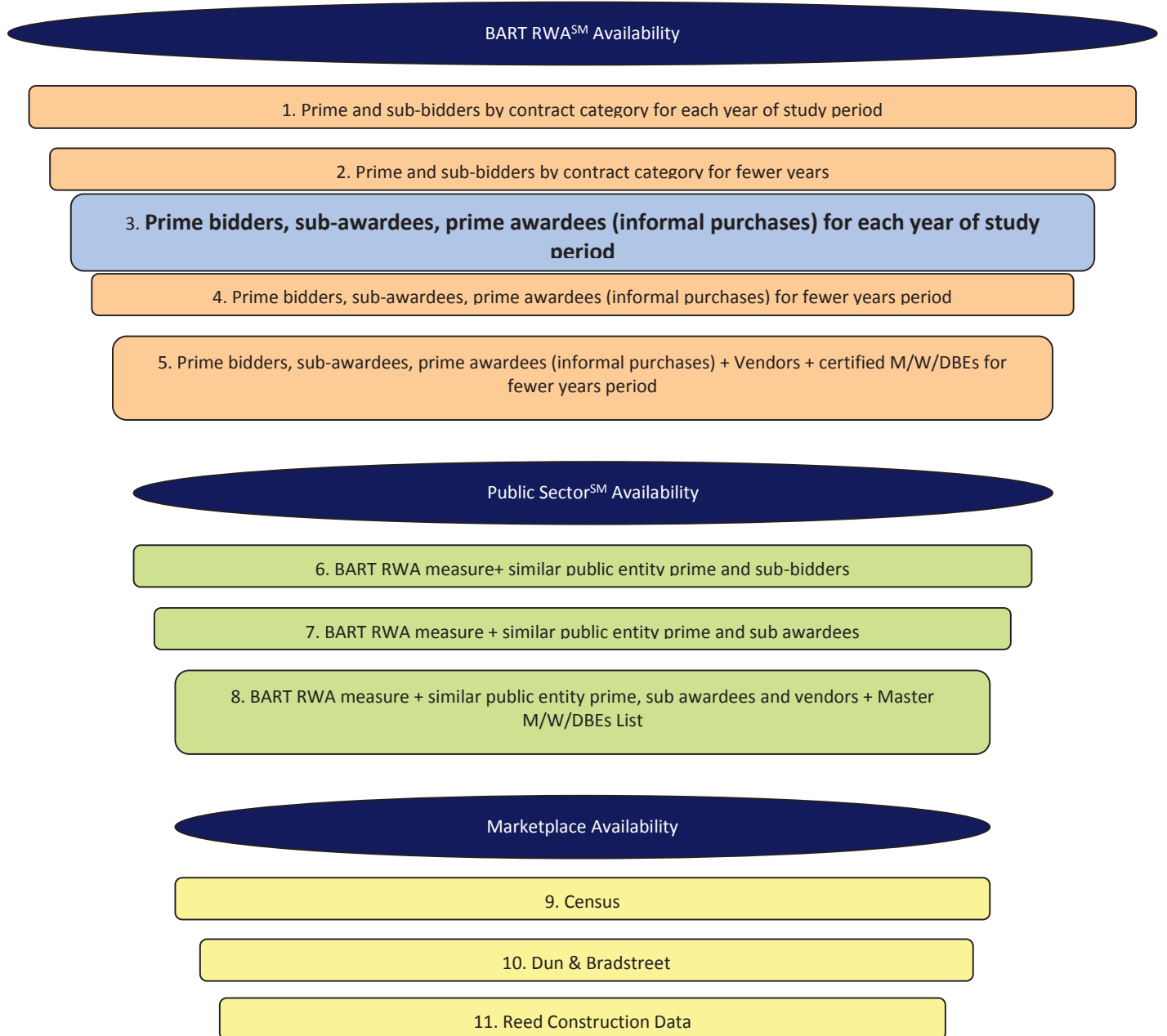
Figure E.1 RWA SM Availability Model