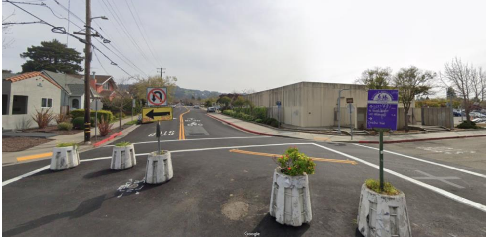
3. Corner at Acton St & Virginia Street from Ohlone Trail to art site.