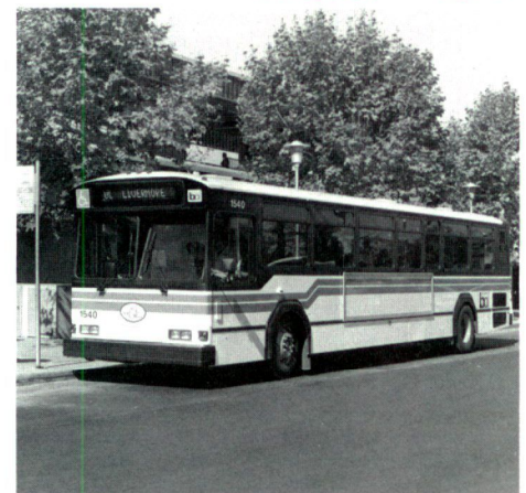
Pictured above is one of 50 recently acquired BART Express Buses with its new paint job. Express Buses provide service to BART stations for people living in the far reaches of Alameda and Contra Costa counties.

Successful candidates will then attend four months at a police training academy, followed by 16 weeks of a BART field training program, before they will be able to wear that badge "with pride."