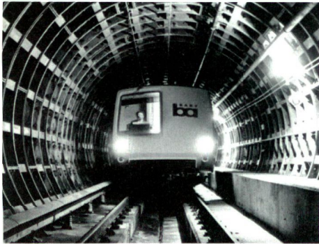
BART's Transbay Tube is one of a kind. A special issue of BARTalk, celebrated the tenth anniversary of the world's longest and deepest underwater vehicular tube in service today.