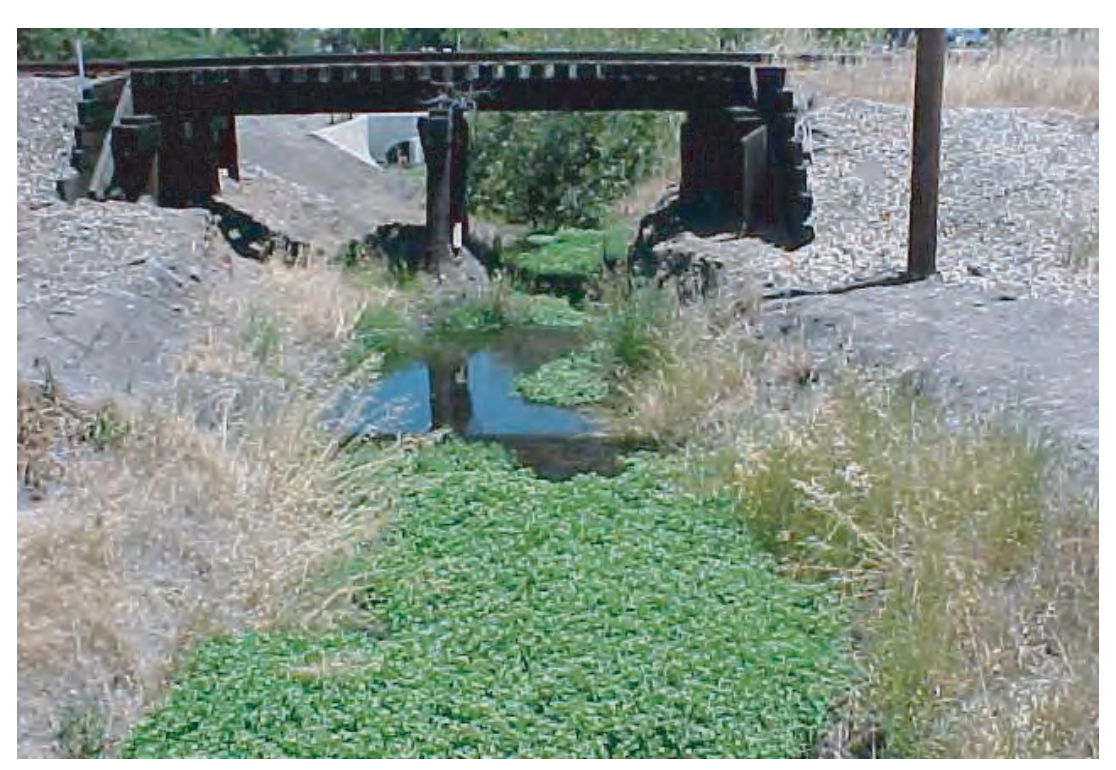
Flood control channel north of Paseo Padre Parkway