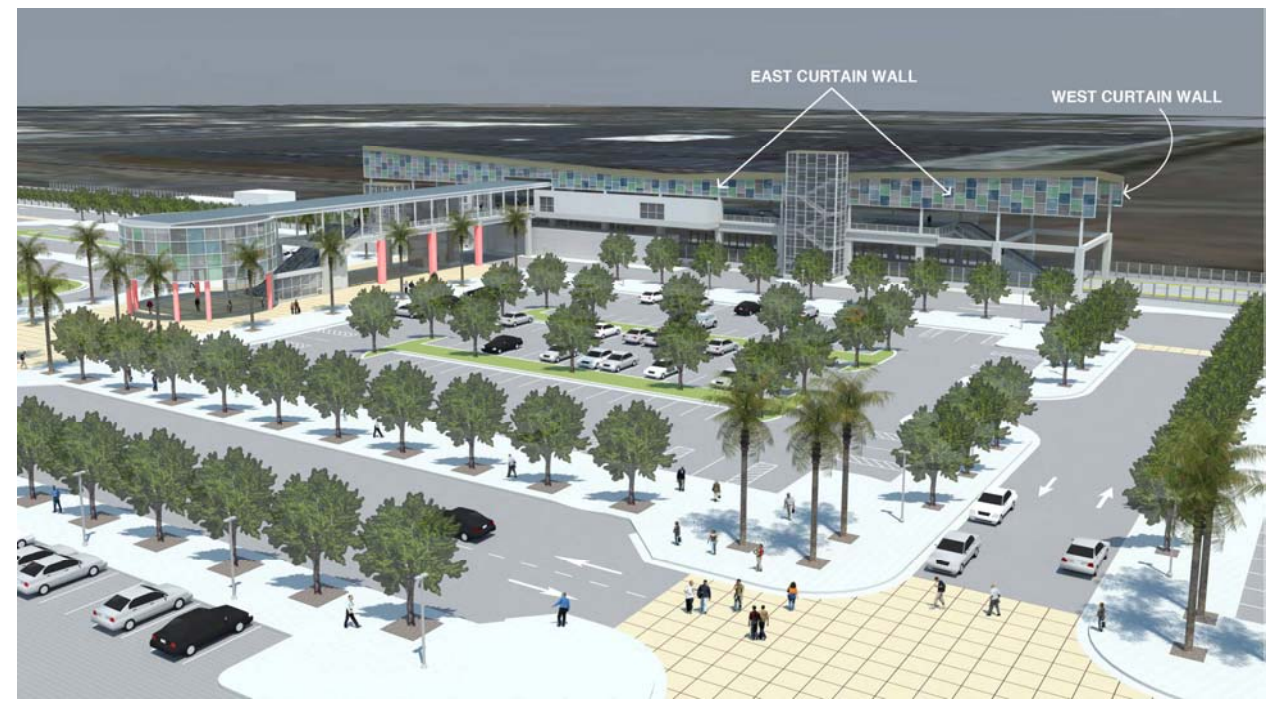
Figure 2: Station Overview with Pavilion and Concourse

This image shows four of the six columns that support the pavilion (as show in Figure 1 above), and three of the six columns that are under the north side of the pedestrian crossing. There are 3 identical columns on the south side of the pedestrian crossing.