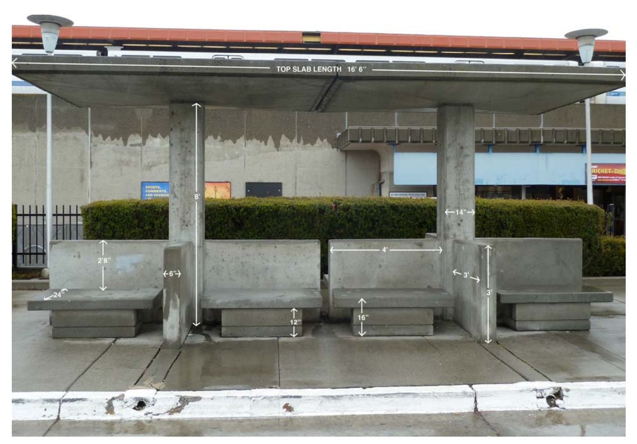
Figure 3: Fremont Station Seating Area

This image shows one of the two identical seating areas at the Fremont Station. Dimensions are approximate; commissioned artists will be required to take field dimensions.