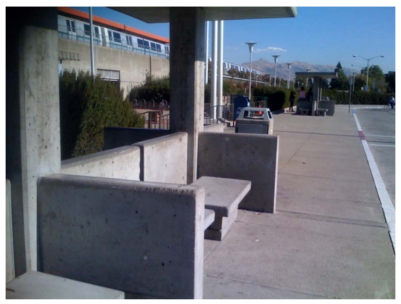
Figure 4: Fremont Station Seating Areas

This image shows a view of both of the seating areas identified to receive artwork