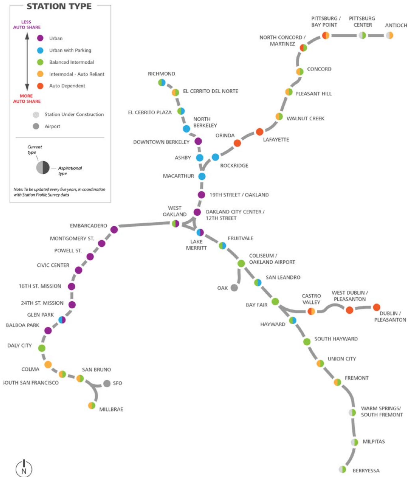
Figure 1: Station Access Types (Bright Blue are “Urban with Parking” stations described in Question 1)