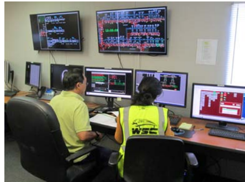
Systems Integration testing is underway.