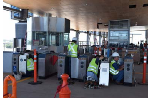
Construction at the Warm Springs / South Fremont Station.