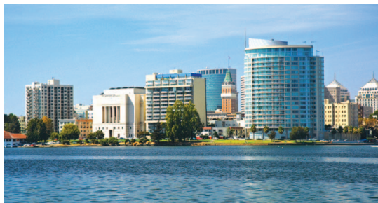
Lake Merritt and the Oakland skyline

12TH STREET/OAKLAND CITY CENTER BART: AC 1 or walk 4 blocks LAKE MERRITT BART: AC 51A