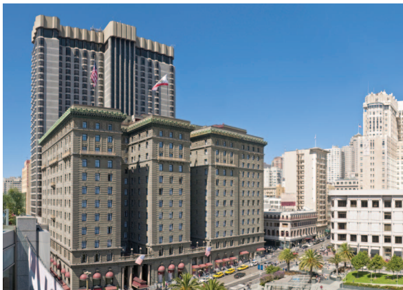
Downtown San Francisco's Union Square

CIVIC CENTER BART: Muni F POWELL STREET BART: Muni F, Cable Cars