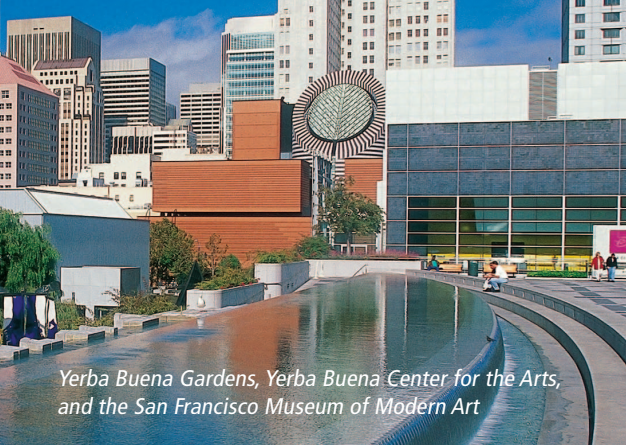
Yerba Buena Gardens, Yerba Buena Center for the Arts, and the San Francisco Museum of Modern Art