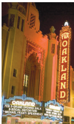
Oakland's Fox Theater

NORTH BERKELEY BART: Free shuttle during track season