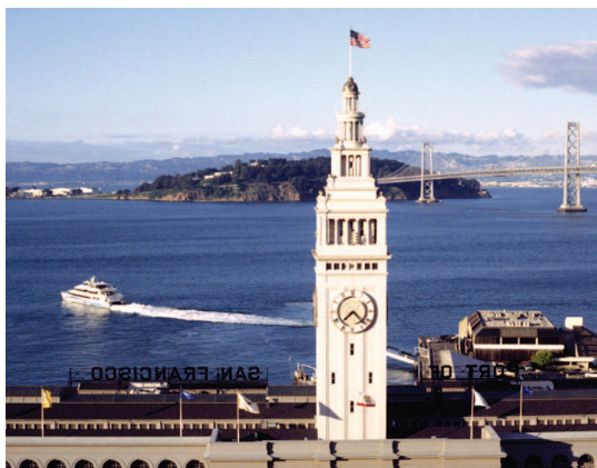
The San Francisco Ferry Building