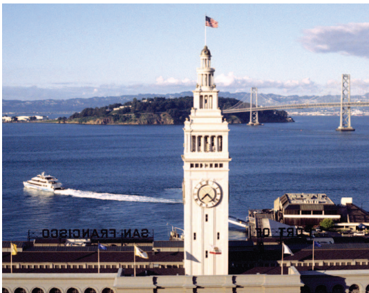
The San Francisco Ferry Building