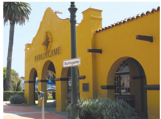
Burlingame Railroad Station, built in 1894, is listed on the National Register of Historic Places

MILLBRAE BART: Caltrain to Santa Clara Station, transfer to VTA's Airport Flyer, Route 10