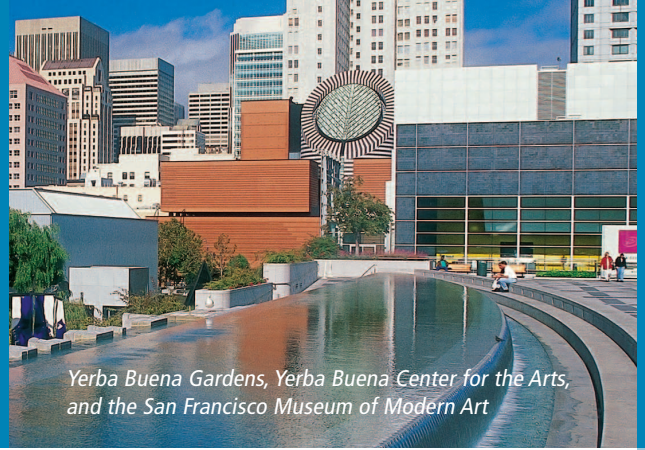
Yerba Buena Gardens, Yerba Buena Center for the Arts, and the San Francisco Museum of Modern Art

Stunning views, historic landmarks, culturally diverse cuisine and shopping—all spread throughout an eclectic mix of neighborhoods—make San Francisco a world-class destination. There truly is something for everyone in this one-of-a-kind city.