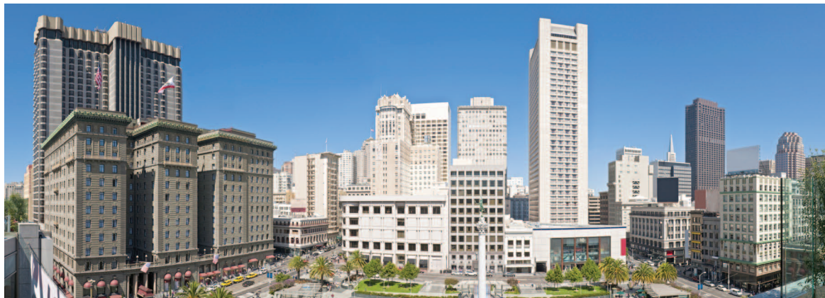
Downtown San Francisco's Union Square