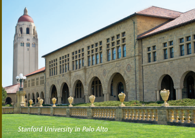
Stanford University in Palo Alto

The South Bay is the gateway to the innovation, creativity and drive that changed the world: Silicon Valley. The San Francisco International Airport BART Station provides seamless access to the International Terminal, taking you anywhere in the Bay Area ... and anywhere in the world.