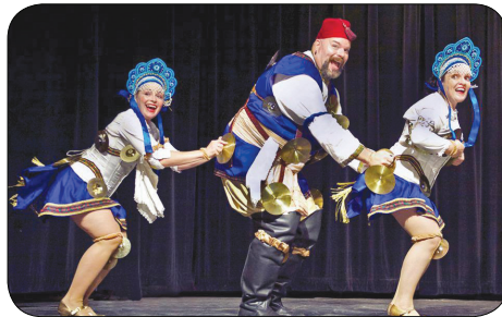
The comedy 'Ballet Russe Spectacle Variété' will be part of the 2014 San Francisco Fringe Festival.

The San Francisco Fringe Festival is back, bringing 40 different rare, raw, raucous and remarkable theater performances to San Francisco from Sept. 5 to 20. The festival offers 150 performances over 20 exciting days. Don't miss it! Visit sffringe.org for more information.