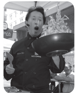
Martin Yan hosts a noodle cooking demo during the 2013 celebration.

The theme for this year's 10th anniversary is "Tastes of Asia," which will showcase Asian food — from ingredients, to preparation, to eating and enjoying it. For more info, visit asianfairsf.com .