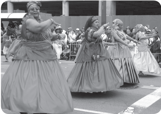
The theme of this year's Carnaval is La Rumba de la Copa Mundial — Celebration of the World Cup . See San Francisco's Mission District come alive during the festival, May 24 and 25.

Take BART to 16th Street Mission or 24th Street Mission stations for Carnaval San Francisco 2014, hitting the streets Memorial Day Weekend, May 24 and 25.