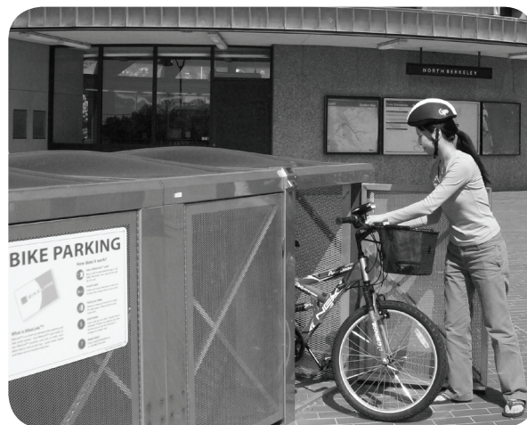
A cyclist parks her bicycle at a BART BikeLink locker. With 1,150 BikeLink lockers system-wide, parking your bike at a BART station is safer and easier than ever.

For more information go to bart.gov/bikes .