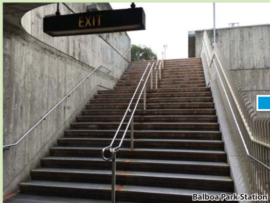
Existing station conditions