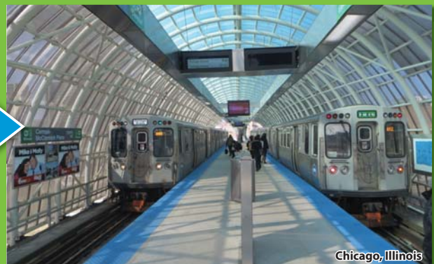
Improved lighting and sight lines contribute to a safer, more open station environment, as in the example above.