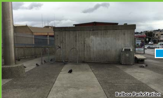
Existing station conditions