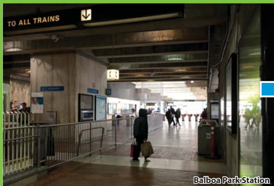
Existing station conditions