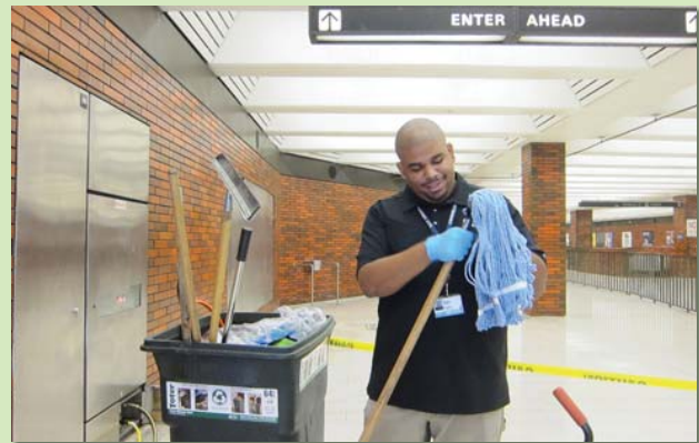
Increased investment in upkeep and maintenance helps keep BART running.