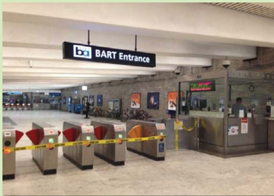
Aging station components and infrastructure lead to periodic service disruptions.