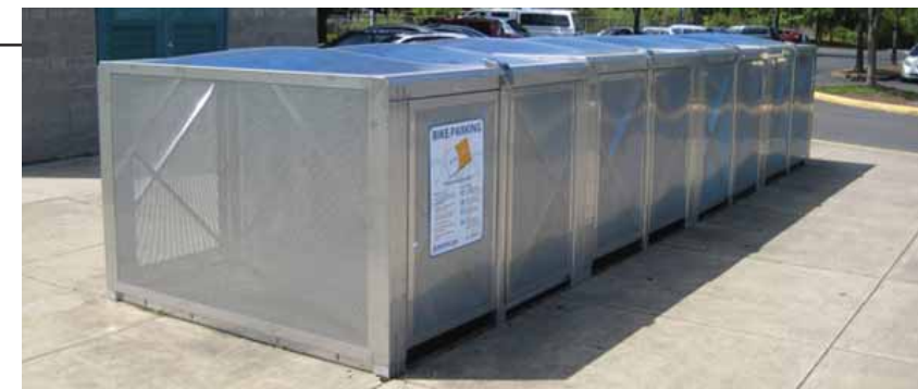
bike lockers below canopy 單車寄放櫃 附頂篷