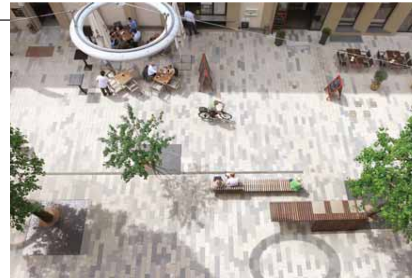
special paving 特別鋪設