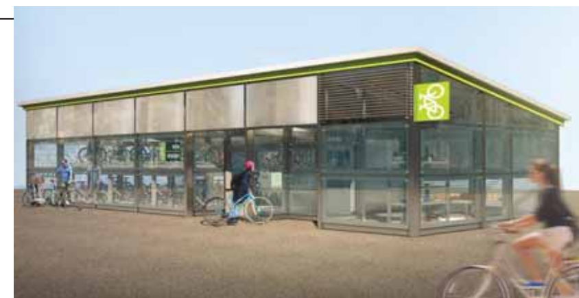
bike station 單車站