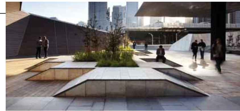
seat platforms with planting 平台座椅與植栽