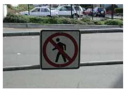
Crossing ban and median fence