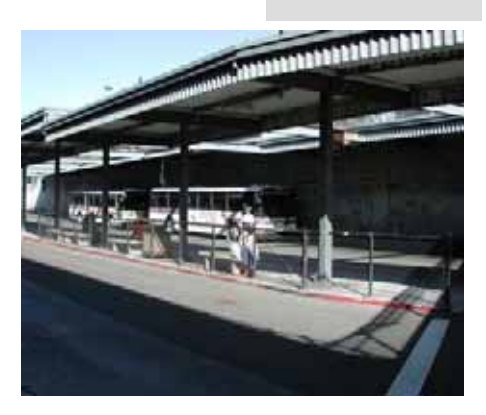
Limited sidewalks, bleak intermodal