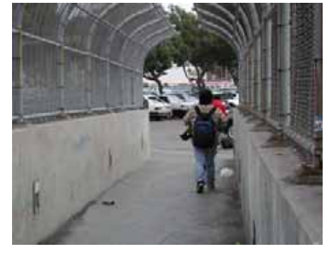
Overcrossing to Parking Lot

Walking to the west of the station is also challenging. There is only one sidewalk on the