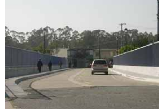
St. Charles Bridge Improvements

TOP: Previous Condition (no south sidewalk, no safety rail, only two streetlights)