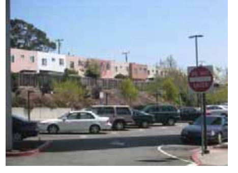
South Parking Lot

An enhancement to BART's parking program would be the integration of real-time information for customers. Digital displays, now common at parking facilities worldwide, could let customers know whether parking is available and where its located. This would add convenience for BART