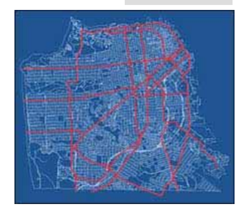
Muni's "X" Plan