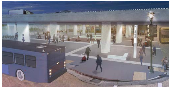
MacArthur BART Plaza Improvements

MacArthur BART Station serves as the 'home station' for approximately 9,000 riders each weekday. AC Transit, Hospital and Emery Go-Round Shuttles also serve the station.