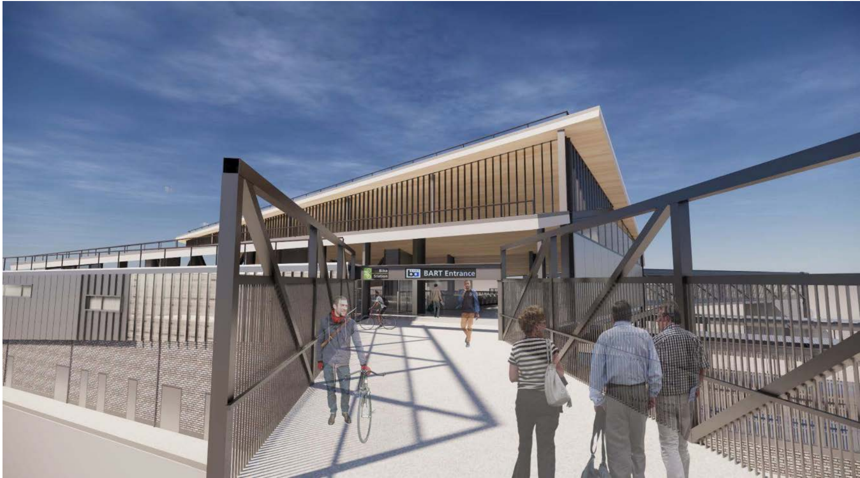
Pedestrian bridge from Osgood Road