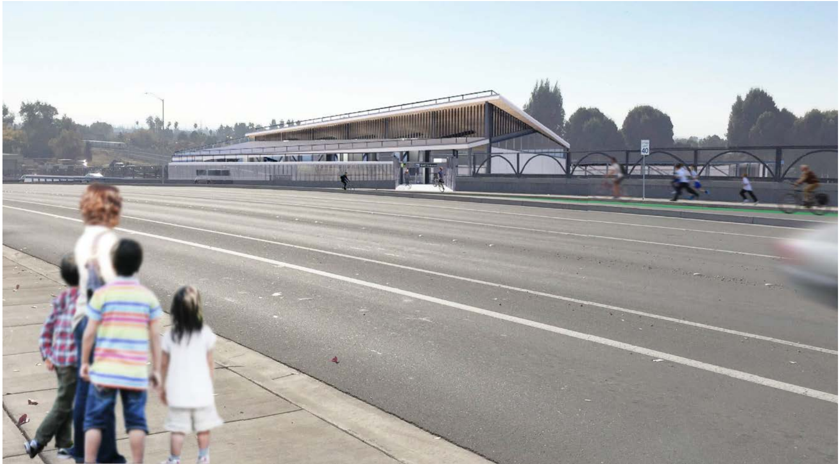
View of Station from Osgood Road near Washington Blvd