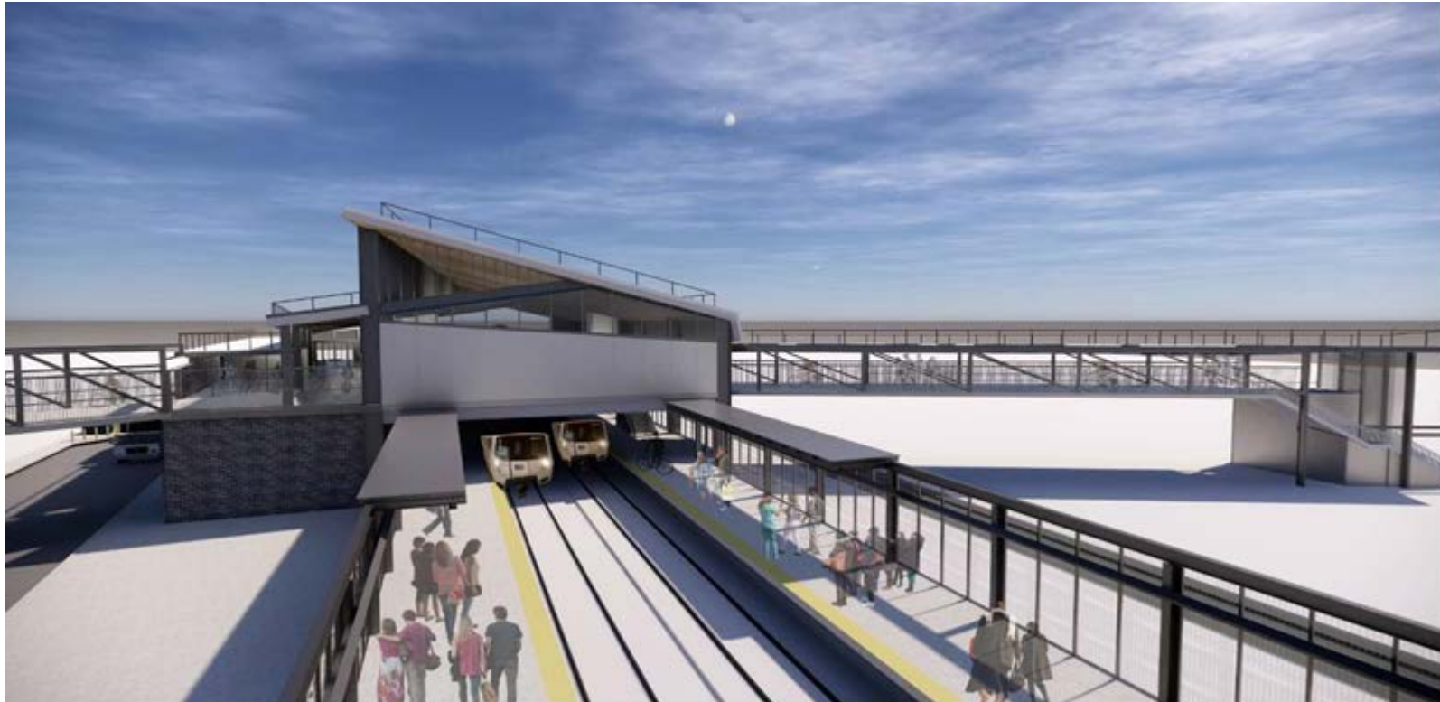
North façade of Irvington Station