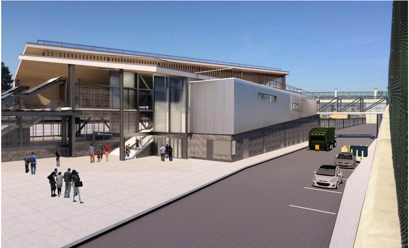
Southeast Elevation including main entrance grand staircase