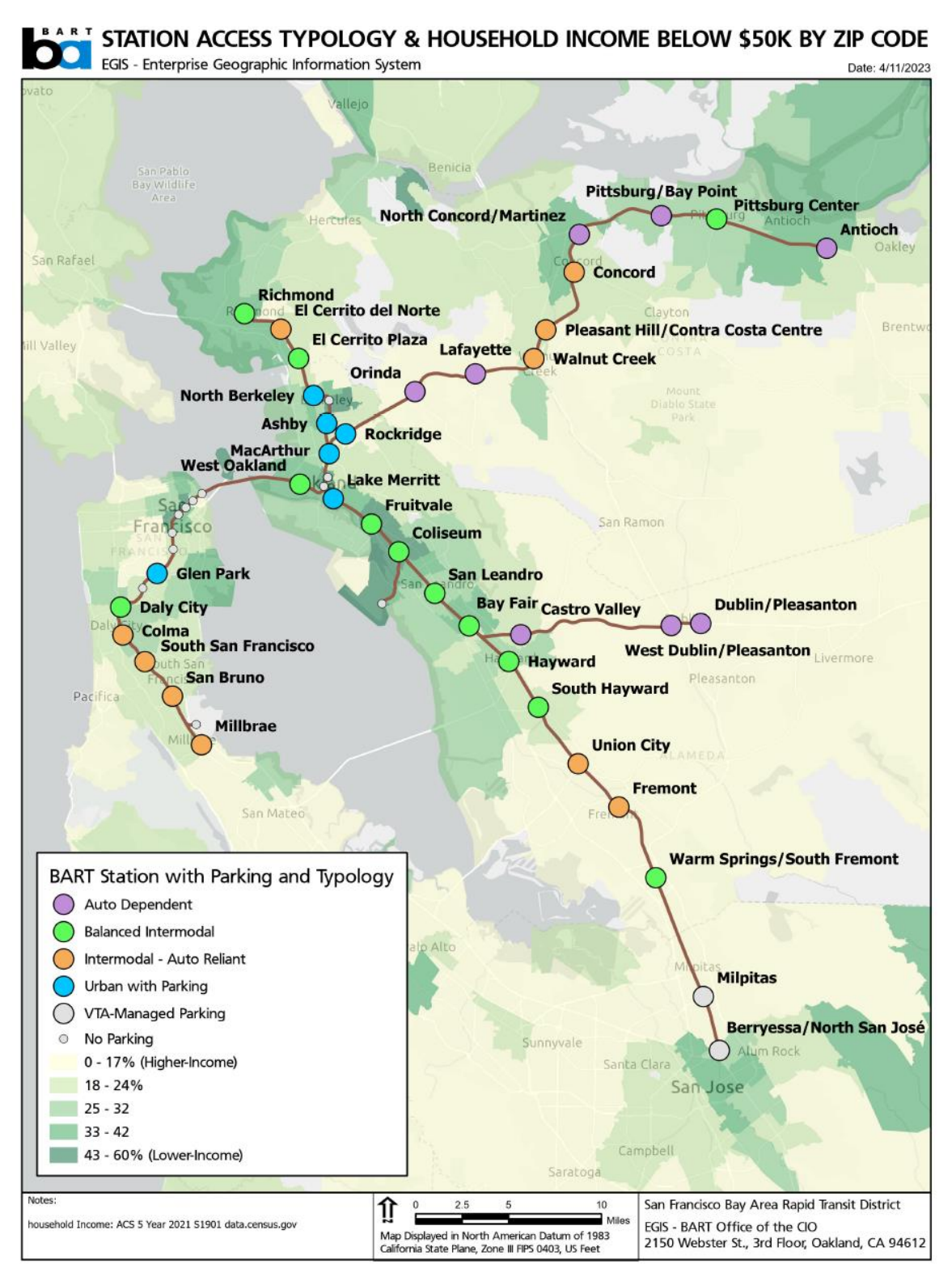
Figure 2 – Station Access Typology & Low-Income Households in the Bay Area